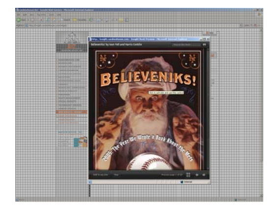
Large Size in Pop-Up Browser Frame (600 x 700 pixels)