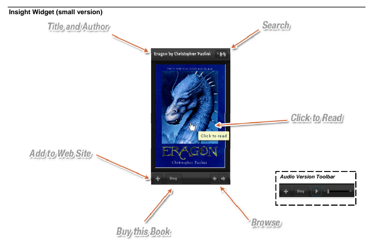
[small size shown]